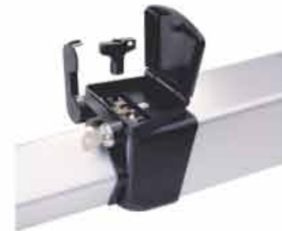
Manual release key and special key for locking top lid covering safety pressure valves of two-way locking